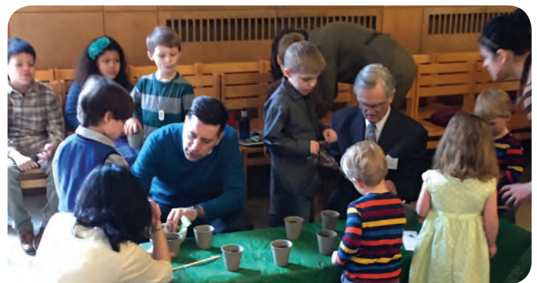
Children planting seeds on Sunday 28 February— a Sermon on the Steps Project.