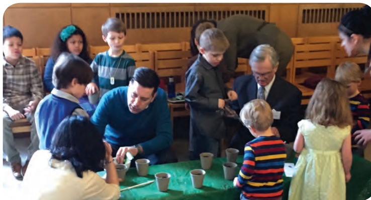
Children planting seeds on Sunday 28 February— a Sermon on the Steps Project.