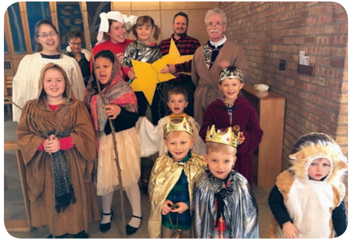
Group photo of participants in our Intergenerational Christmas Pageant in December. More on page 6.