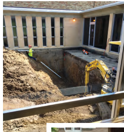
Left: The atrium provides a great view of a deep hole that reveals one of our tunnels between the buildings.

The construction program includes digging up all of the courtyard to waterproof the tunnels and the lower-level walls. The lilac tree in the courtyard will be replaced with a smaller tree. The roots of the existing one were growing into the cracks in the wall and adding to our water intrusion. The project will include replacing all of the existing concrete that was very uneven and had become a safety problem. The limestone columns in the arcade will be repaired and the one step at our entry doors will be eliminated by raising the plaza level.