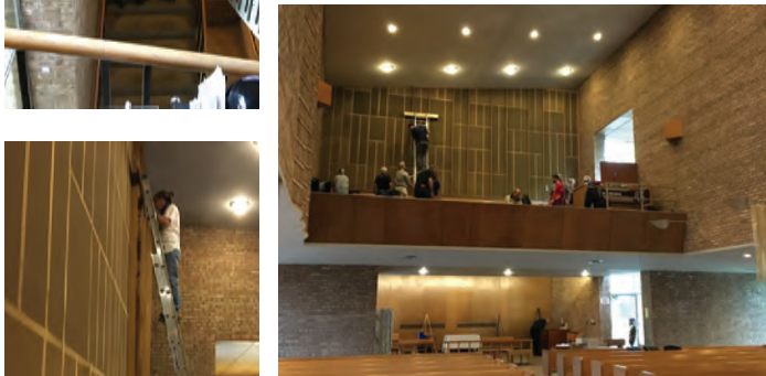
Clockwise from top left: